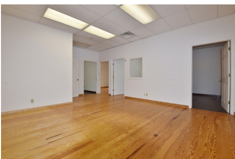
Suite 8030 C-2 - Reception