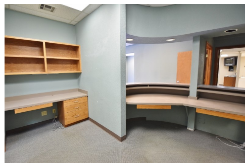
Suite 8026 - Reception Work Area