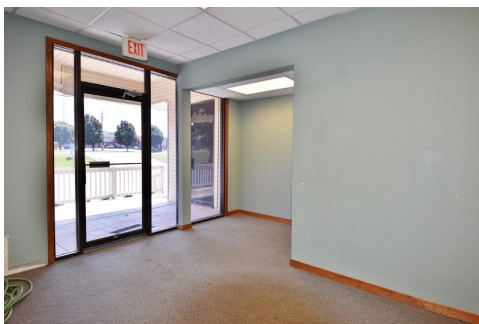
Suite 8026 - Reception