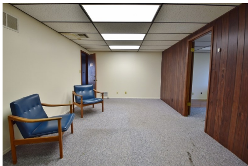
Suite 200 - Reception