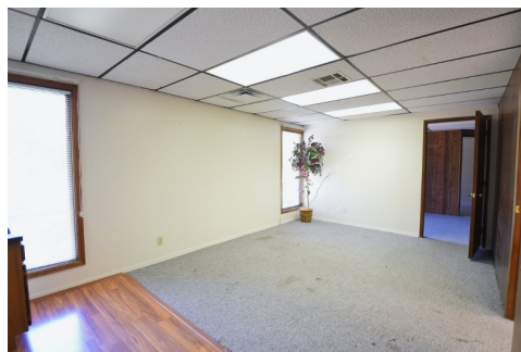
Suite 200 - Large Private Office