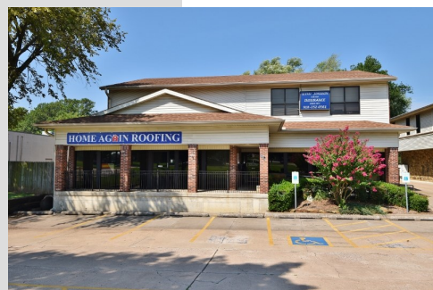
Suite 8030 C-2 - Exterior