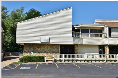
Suite 8026 - Exterior View

8014 - 8030 South Memorial Drive, Tulsa, OK 74133