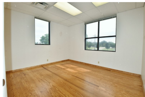
Suite 8030 C-2 - Corner Office